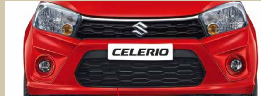
Stylish Front Grille & Bumper Design

The Celerio is a true reflection of you. Progressive, stylish and contemporary. Its dynamic exterior that features stylish Front Grille Design, elegant back door garnish and a wide rear, makes for a stunning first impression. A peek into its dual tone interiors with new seat fabric design is sure to invite you to feel the richness of its refreshing new cabin. Truly, the current enhancement takes the overall look a notch above.