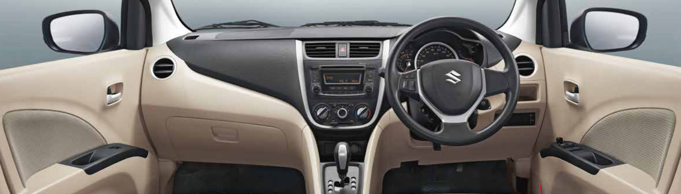
Exciting Dual Tone Interiors