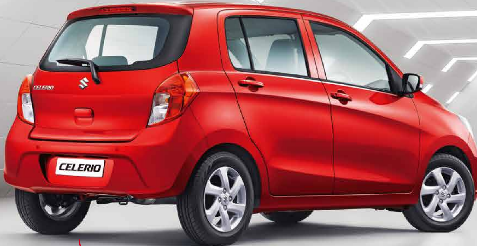
Impressive Wide Rear with Elegant Back Door Garnish