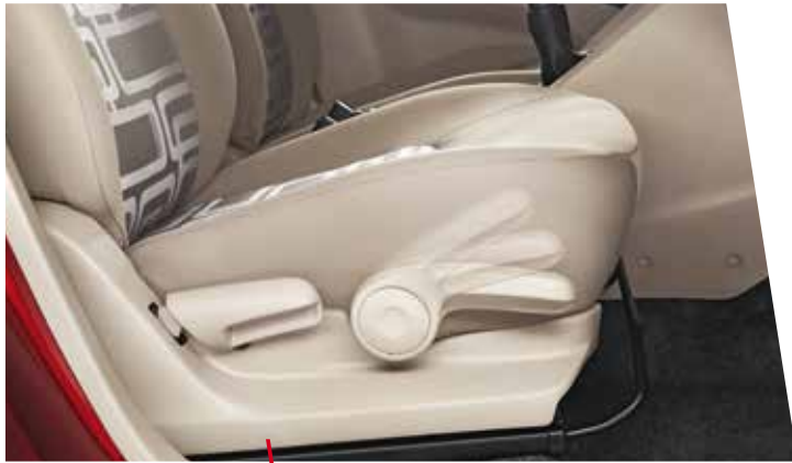
Seat Height Adjuster