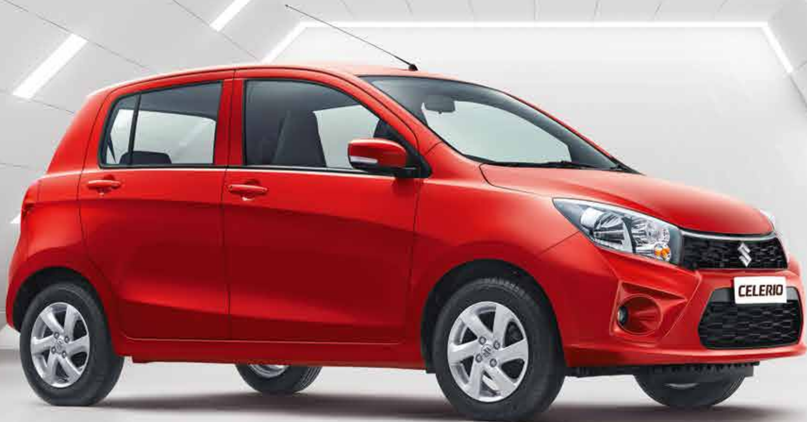
Stylish Alloy Wheels