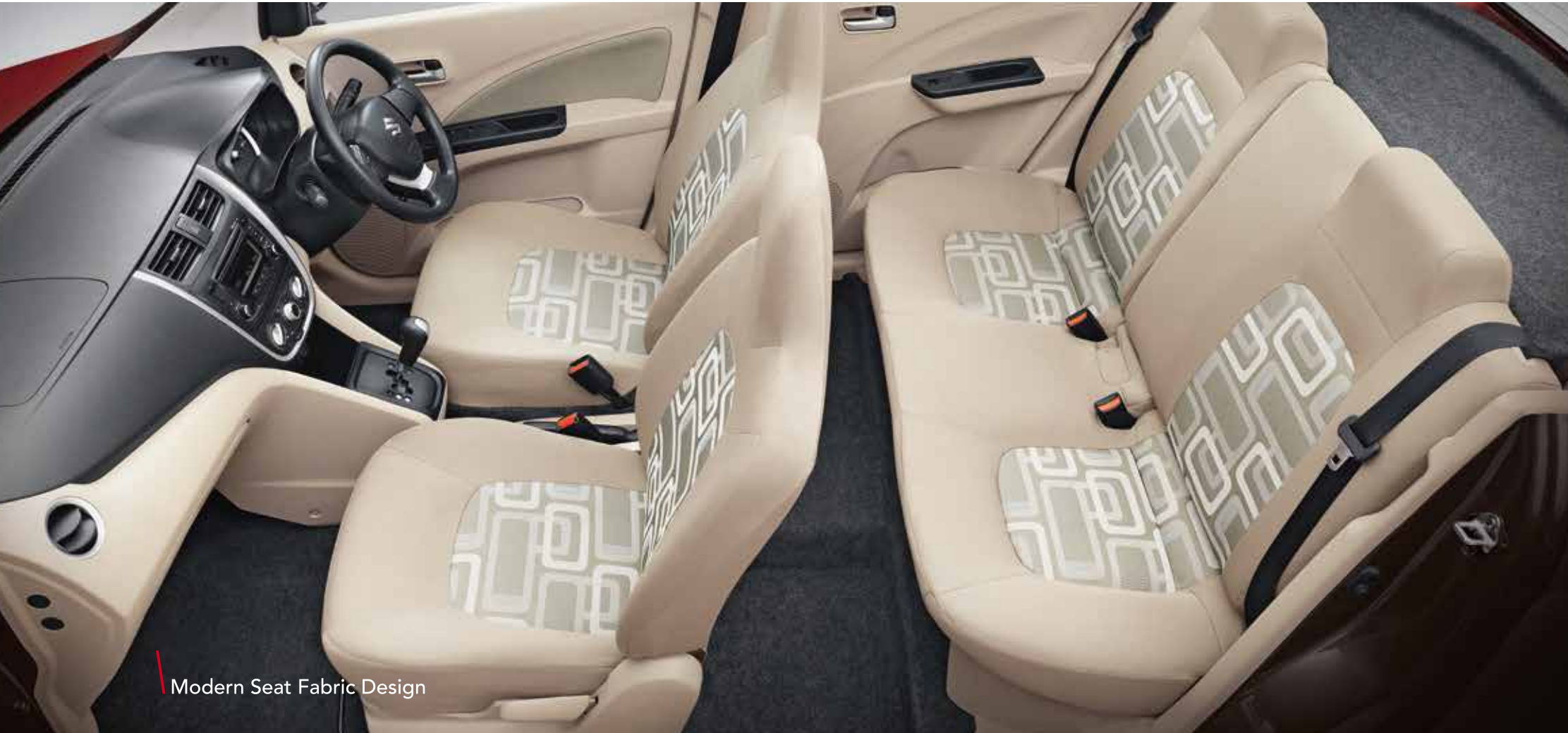
Modern Seat Fabric Design

Be at complete ease as you discover a world of space in the Celerio. Beyond its generous cabin space, there is Seat Height Adjuster, Electronic ORVMs and a host of other features that take care of your comfortable driving experience.